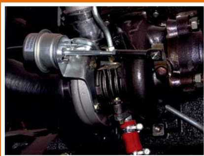
4 Cyl. Turbo Diesel Engine.