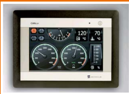
Electronic Engine Controller.