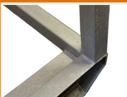
Hot Dip Galvanized Frame.