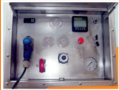
Shielded Control Panel.