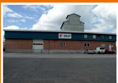
DEN-JET Factory Denmark