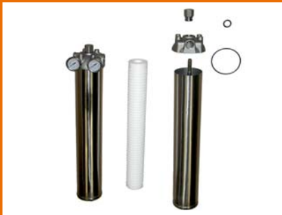
Strainers & Filtration.