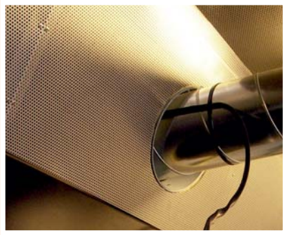
Sound Proofed Container Insulation Stainless Steel Coverage.