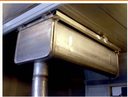
Sound Proofed Exhaust.