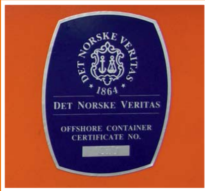
Optional DNV 2.7-1 Approved 14" Container.